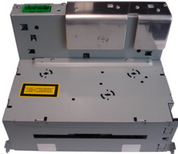
Radio CD Module